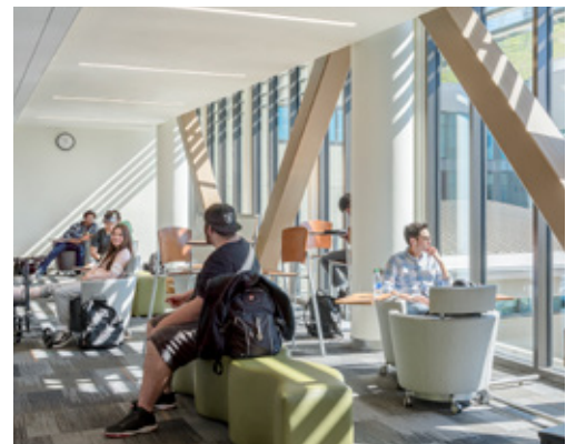
↓ Student Collaboration Space

This project was able to use many innovative technologies, such as LED lighting and solar heating for domestic hot water, but the truly most innovative part of the project was the design of the central utility plant. This central utility plant employs an earth-coupled bidirectional cascade chiller system with heat-recovery chillers to generate chilled water and heated hot water for campus distribution. The chilled water system is designed to maintain a Delta T of 20 degrees F, and the heating water design is operation at a 130-degree maximum discharge water temperature. The earth-coupled system acts as a heat sink and allows heat energy to be stored and extracted in the ground for later use. The system utilizes a tertiary pumping arrangement for the heating and chilled water systems to each building and as future buildings are connected to the central utility plant. The secondary pumps are sized to pump water through the campus distribution loops, while the tertiary pumps in each building will pump the water through the individual buildings. Although the central utility plant will initially serve only the three new buildings, most of the 12 existing buildings will be connected over the longer term. The geothermal bore field was designed to be phased as buildings are brought on-line. Chilled water and heating water distribution piping are stubbed out to points on the site so that they can connect to the additional buildings in the future.