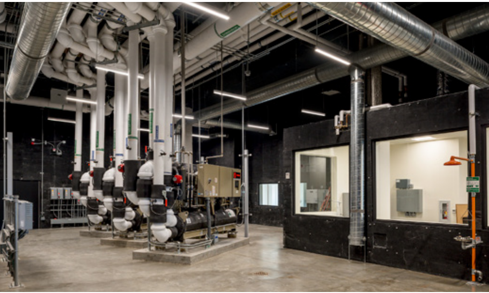
← Central Utility Plant